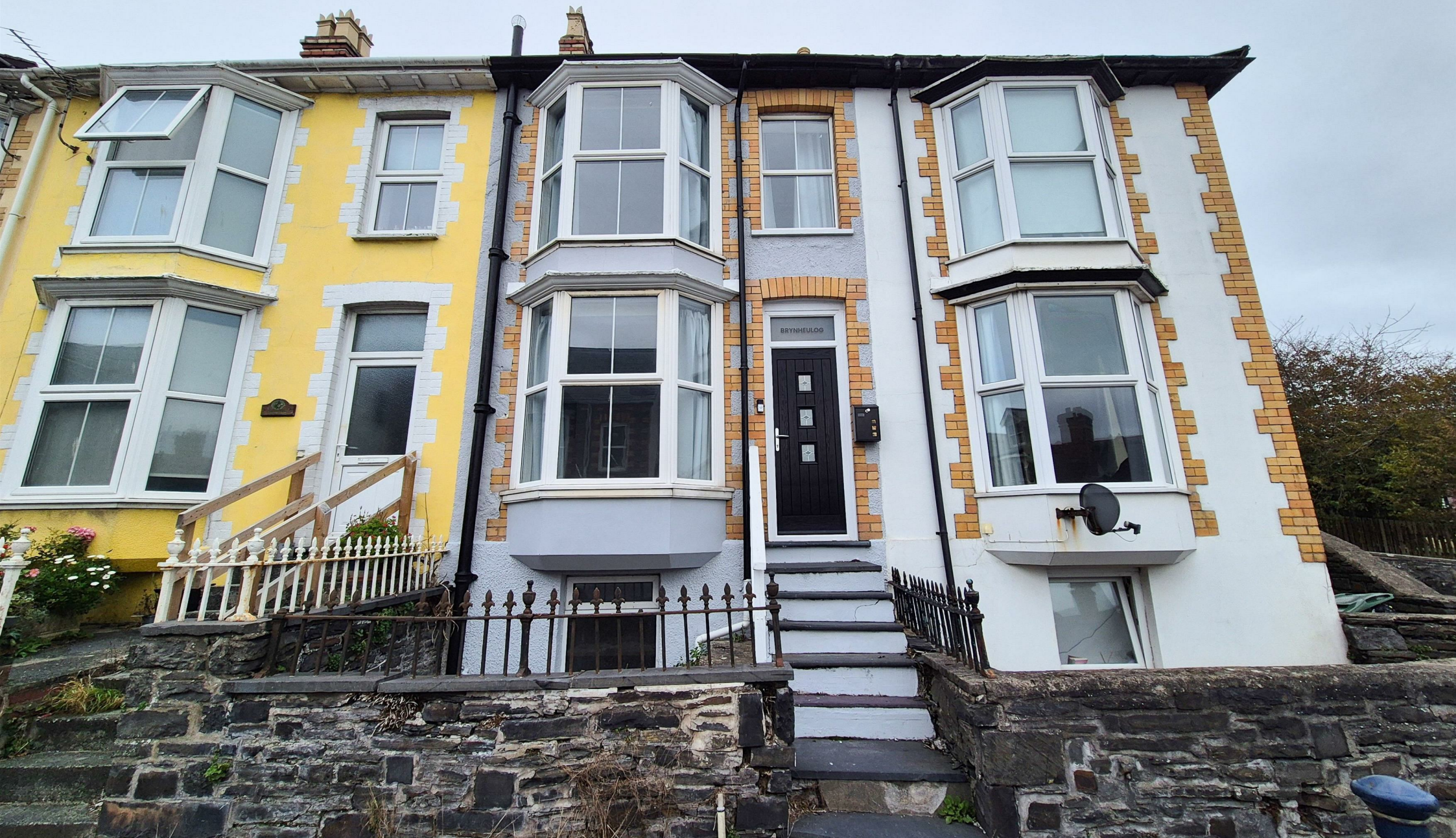
Brynheulog North Road, Aberystwyth Ceredigion SY23 2EL Guide price £285,000